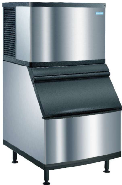
ES-460 Ice Machine on E-400 Bin